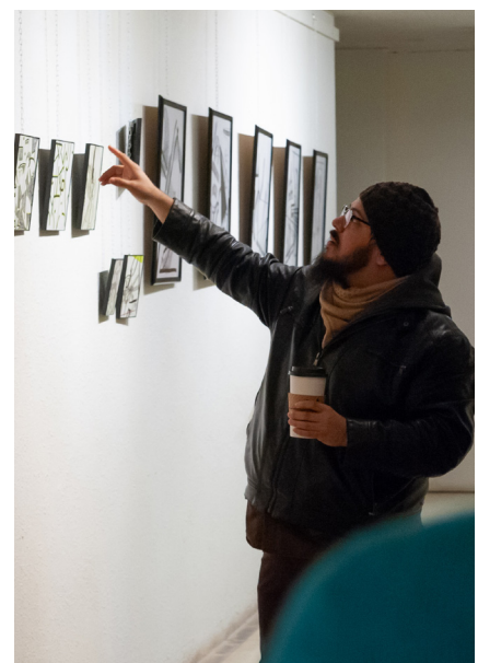
Right: SEE MORE PERSPECTIVE gives insight on his artwork during the soft opening.